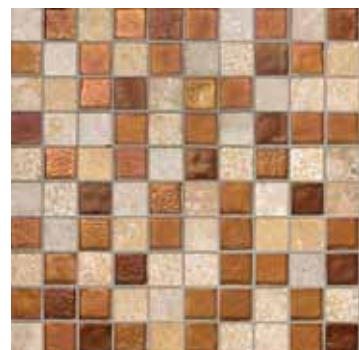
Revel Glass: Amber Irid, Henna Irid Travertine: Golden Blend, Light Brown Blend