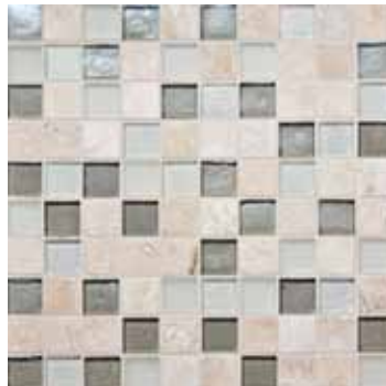
Glee Glass: Oxygen Irid, Oxygen Matte, Platinum Irid Travertine: Cream Blend