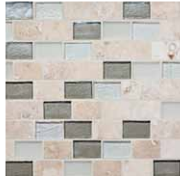
7/8" x 1 3/8" (22 x 35mm) Offset Joint Nominal Sheet Size: 11 1/8" x 11 1/8" (282 x 282 mm) Shown in Glee Blend