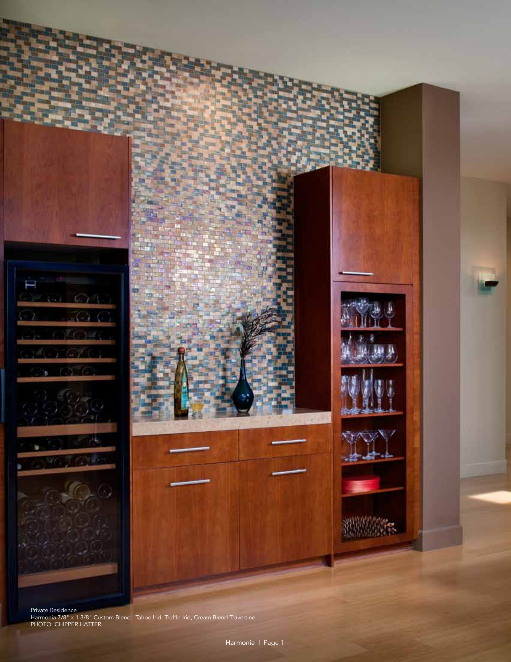
Private Residence Harmonia 7/8" x 1 3/8" Custom Blend: Tahoe Irid, Truffle Irid, Cream Blend Travertine