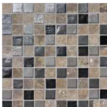
Gala Glass: Shadow Irid, Platinum Irid, Pewter Irid Travertine: Grey Blend