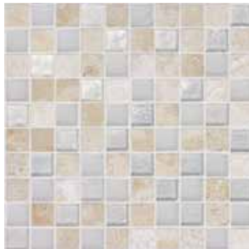
Levity Glass: Oxygen Irid, Oxygen Matte Travertine: Cream Blend

Harmonia is available in 7/8"x 7/8" mosaic field. All sizes and patterns and can be customized using any Muse color and finish in combination with your choice of five travertine blends. Try our custom blend tool at www.glasstile.com