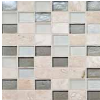
7/8" x 1 3/8" (22 x 35mm) Straight Set Nominal Sheet Size: 11 1/8" x 11 1/8" (282 x 282 mm) Shown in Glee Blend