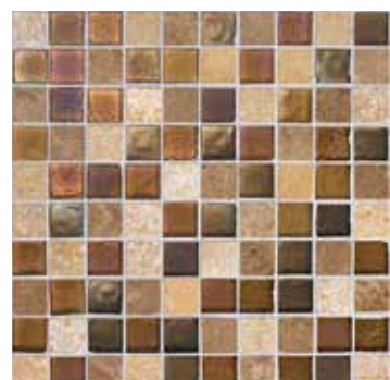
Entice Glass: Harvest Irid, Truffle Irid Travertine: Dark Brown Blend, Golden Blend