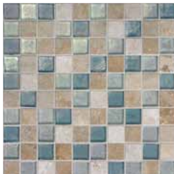
Delight Glass: Clear Irid, Pacific Irid Travertine: Cream Blend, Light Brown Blend